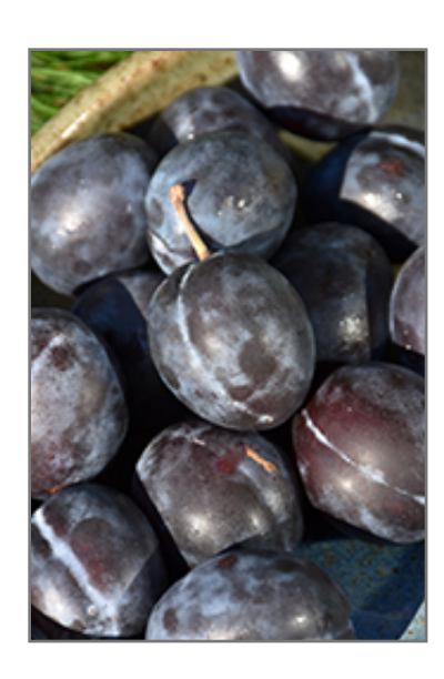
Stanley Plum fruit

This is a deciduous tree with a more or less rounded form. Its average texture blends into the landscape, but can be balanced by one or two finer or coarser trees or shrubs for an effective composition. This plant will require occasional maintenance and upkeep, and is best pruned in late winter once the threat of extreme cold has passed. Gardeners should be aware of the following characteristic(s) that may warrant special consideration;