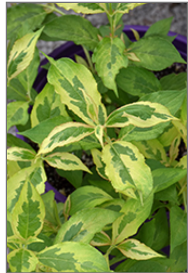
My Monet Sunset Weigela foliage

My Monet Sunset Weigela is recommended for the following landscape applications;