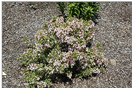
Rainbow Sensation Weigela in bloom