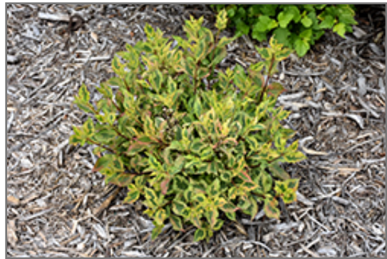
Rainbow Sensation Weigela

Rainbow Sensation Weigela makes a fine choice for the outdoor landscape, but it is also well-suited for use in outdoor pots and containers. Because of its height, it is often used as a 'thriller' in the 'spiller-thriller-filler' container combination; plant it near the center of the pot, surrounded by smaller plants and those that spill over the edges. It is even sizeable enough that it can be grown alone in a suitable container. Note that when grown in a container, it may not perform exactly as indicated on the tag - this is to be expected. Also note that when growing plants in outdoor containers and baskets, they may require more frequent waterings than they would in the yard or garden.