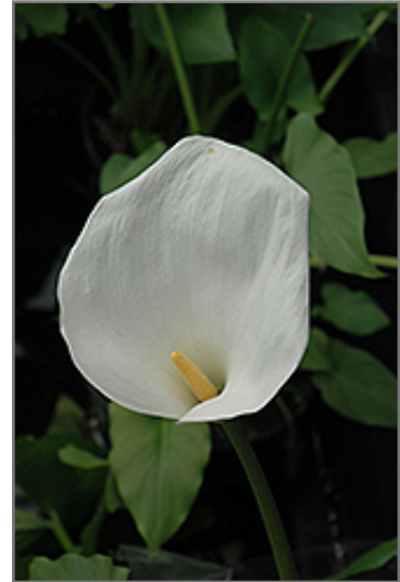
Calla Lily flowers